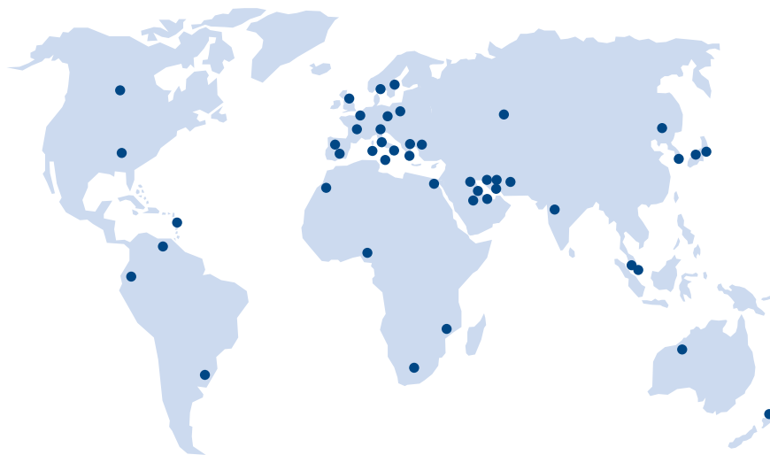
Figure 1. Global reach of Arthur D. Little process safety services